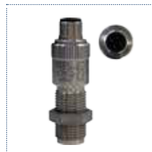
B –Ex approved (Ex ia) IntrinsicallySafe –NPN N –Ex approved (Ex ia) IntrinsicallySafe –NAMUR T – High Temperature Max temp–150°C