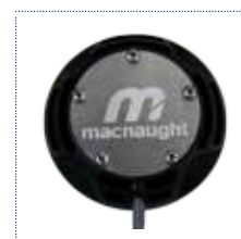
A –Standard Pulse Reel/Hall Effect I –Standard Pulse Reel/Reed Effect J –Standard Pulse Hall/Hall Effect K –High Resolution Hall NPN

The MX19 3/4" Digital Flow Meters are suitable for flows between 3–80L/min. The 3/4" Digital Flow Meters have an accuracy of +/-0.5% and provides exceptional levels of reliability and durability.