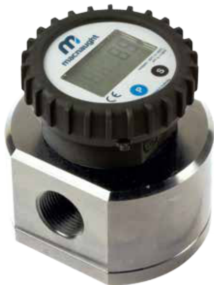
MX19P-1SE Stainless steel body with LCD register