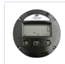
F –ER LCD Display (17mm) G–ERA LCD Display (17mm) H–ERB LCD Display (17mm) Batch controller