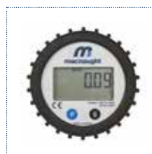
D –PR LCD Display (12mm) E –PRA LCD Display (12mm) with outputs