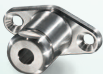
Wall mounting flange

The sensor element for the flow measurement is located between the two "dumbbell disks", which ensure an aerodynamic flow line. A resistant plastic coating (PU, black) or Parylene (transparent) is available as an option.