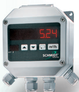
LED display in wall housing